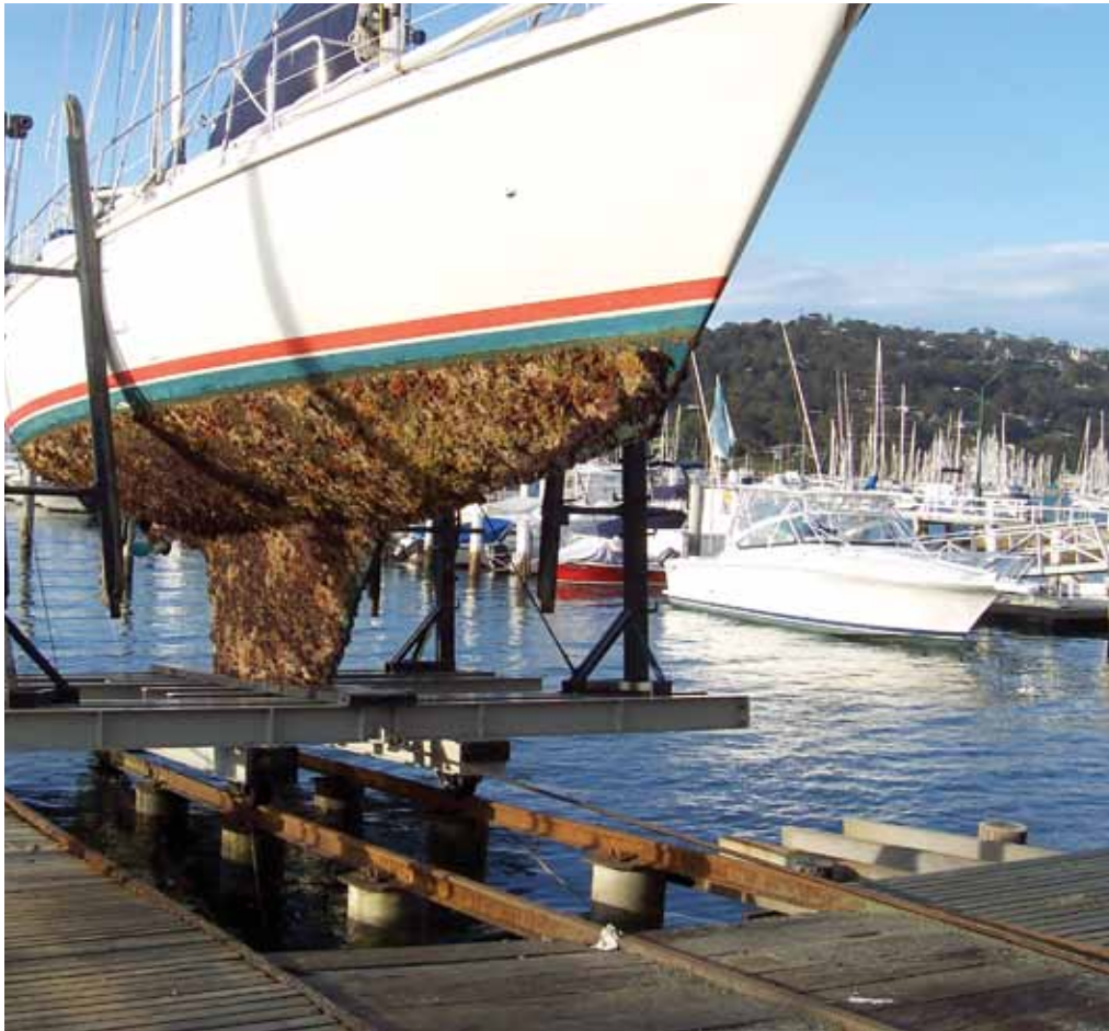
A heavily biofouled yacht being slipped for a clean and antifouling paint renewal.