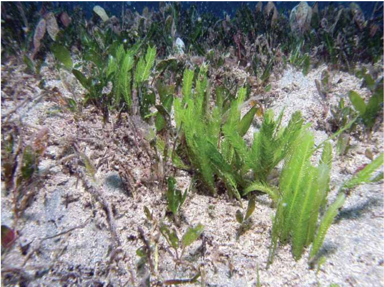
Live aquarium caulerpa ( Caulerpa taxifolia ) underwater.