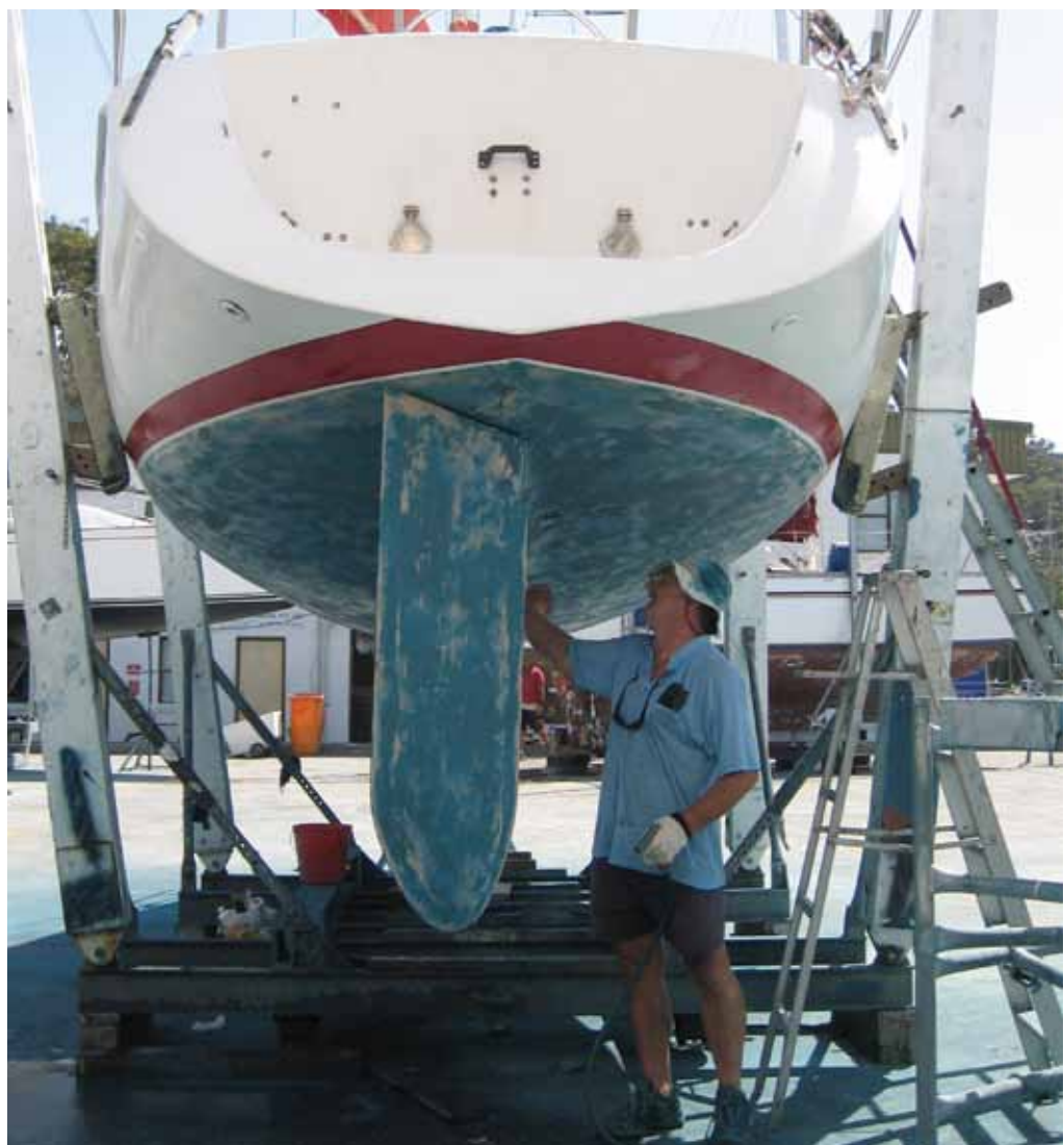
A recreational vessel's old antifouling coating being sanded back before a fresh coat is applied.

Consult your antifouling coating supplier for advice. Remember antifouling products containing tributyltin cannot be used in Australia.