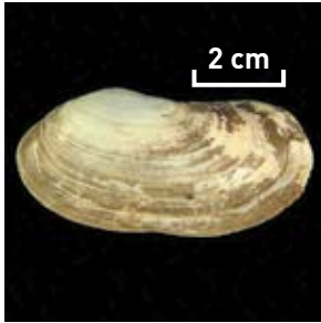
Gaper clam Lutraria rhynchaena