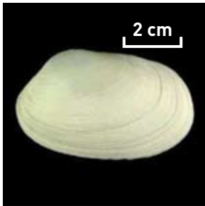
Venus cockle Venerupis galactites