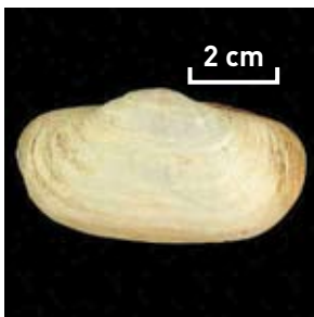
Lantern/gaper shell Laternula recta/rostrata