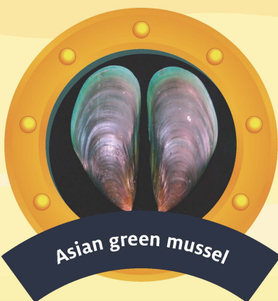
Asian green mussel