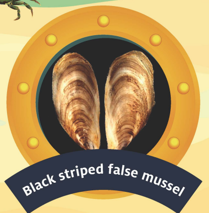
Black striped false mussel