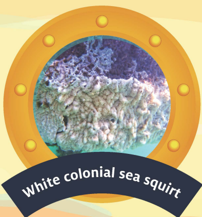
White colonial sea squirt