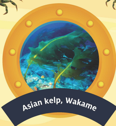
Asian kelp, Wakame